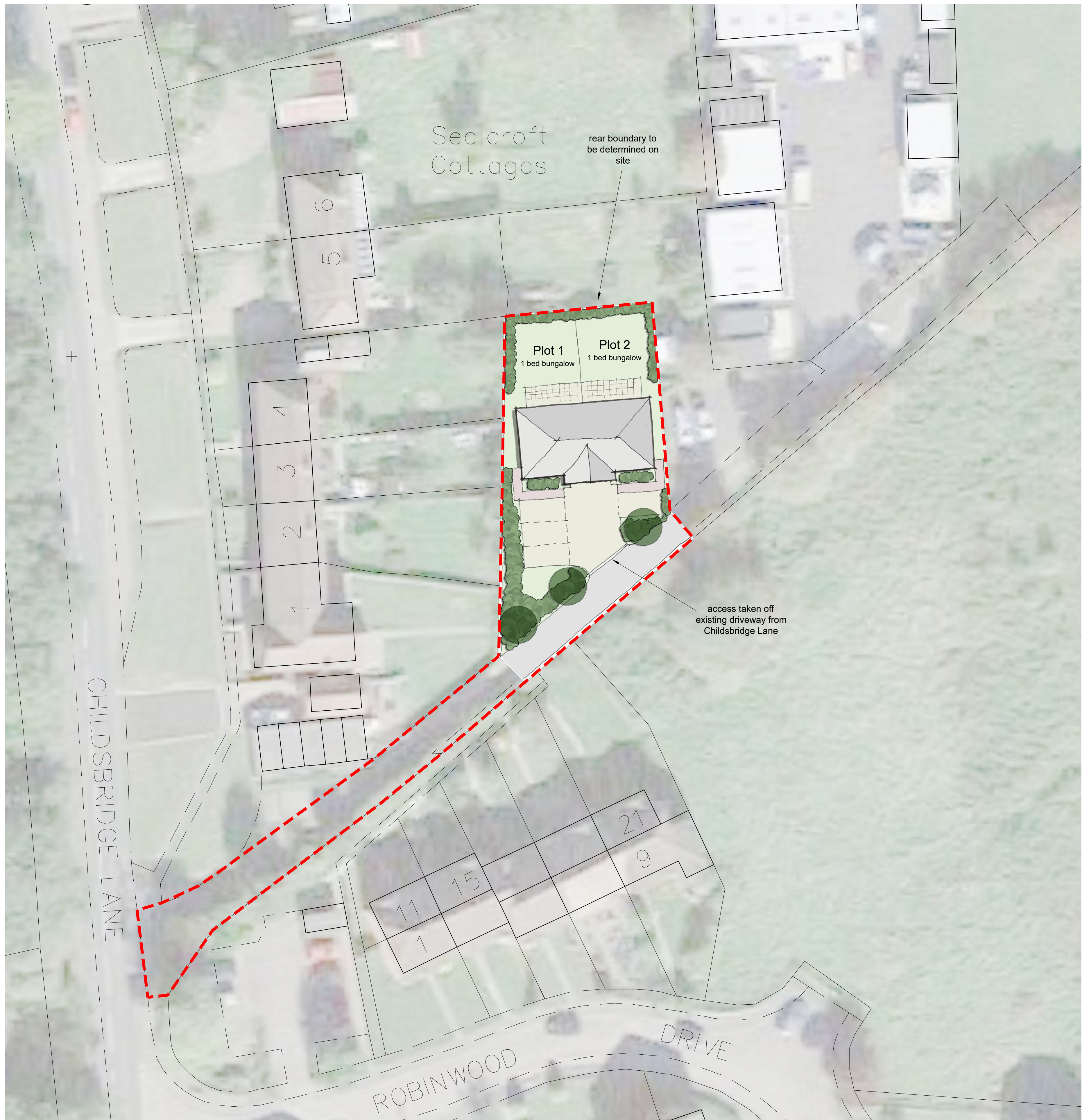
Proposed Site Layout 1:250@A1